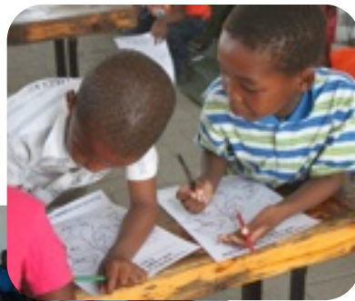
Approx. 120 kids are being disciplined each week at HOPE Church in Freedom Park.