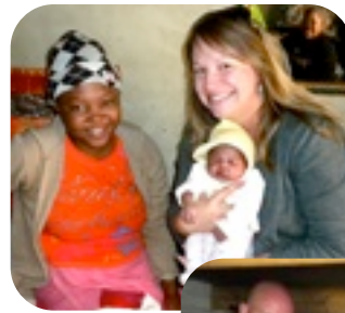
Weekly home visits to Tapologo clinic patients and HOPE Church members in Freedom Park