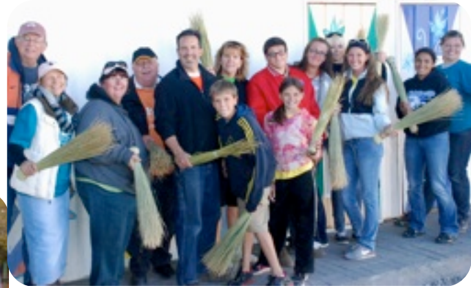
Christian Life School in Kenosha, WI