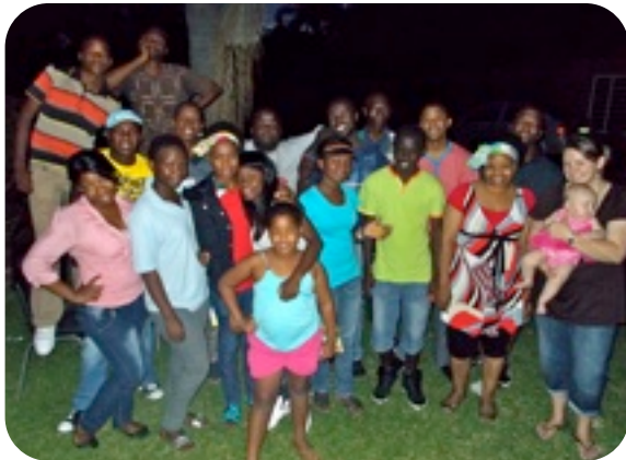
Our South African ministry team