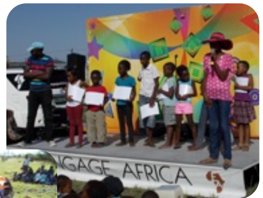
Hundreds of children responded the Gospel and were invited to attend local churches