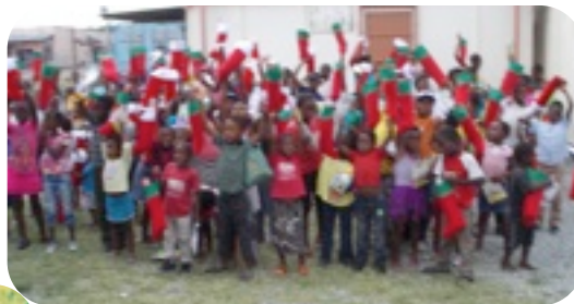
Stockings filled with goodies for the kids