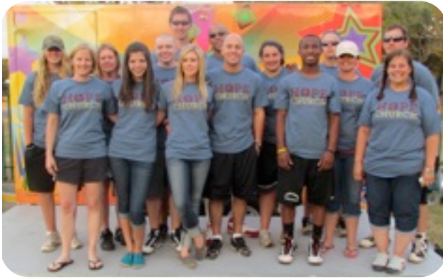
Calvary Temple Christian Center in Springfield, IL