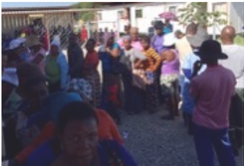
Waiting in line to be tested

At Hope Church, we have been emphasizing the importance of Bible reading. We want our Hope Church family to be equipped for every spiritual battle, and we know that only comes through Bible reading and prayer! Many of our church family are beginning to grasp the value of the written Word of God which, in a mainly oral culture, is a great victory. However, with this new growth has also come a new awareness of a specific need. We find that many are having trouble reading their Bibles or taking notes in church because they cannot see properly. We have had many requests for reading glasses. We have been providing reading glasses as we can, but we have had no really good way to test to see if we are providing the correct strength since all the tests we found online involve reading English sentences.