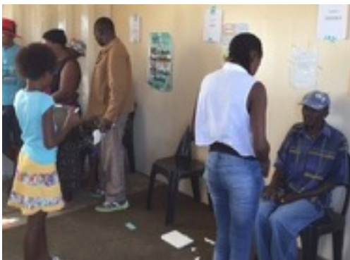
Using iPads for vision screening

At Hope Church, we have been emphasizing the importance of Bible reading. We want our Hope Church family to be equipped for every spiritual battle, and we know that only comes through Bible reading and prayer! Many of our church family are beginning to grasp the value of the written Word of God which, in a mainly oral culture, is a great victory. However, with this new growth has also come a new awareness of a specific need. We find that many are having trouble reading their Bibles or taking notes in church because they cannot see properly. We have had many requests for reading glasses. We have been providing reading glasses as we can, but we have had no really good way to test to see if we are providing the correct strength since all the tests we found online involve reading English sentences.